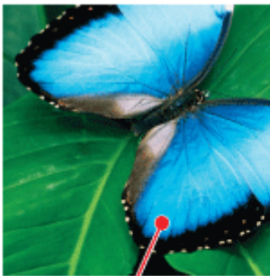
Picture created and printed at a high resolution of 350 dpi.

The images designed for the web are done at a low screen resolution of 72 dpi. Print images need to be created at 350 dpi or there will be a substantial drop in the image quality.